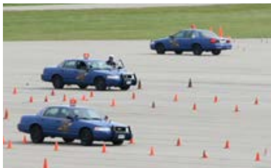
Michigan State Police Drive Track

The advisory in-service training standards were created to assist law enforcement officers in serving the people of Michigan. By meeting these training standards, agencies will reinforce officer safety, sound tactics, and judgment. By partnering with professionals and practitioners from around the state, the task of creating these advisory in-service standards has been achieved in a manner applicable to all Michigan law enforcement agencies.