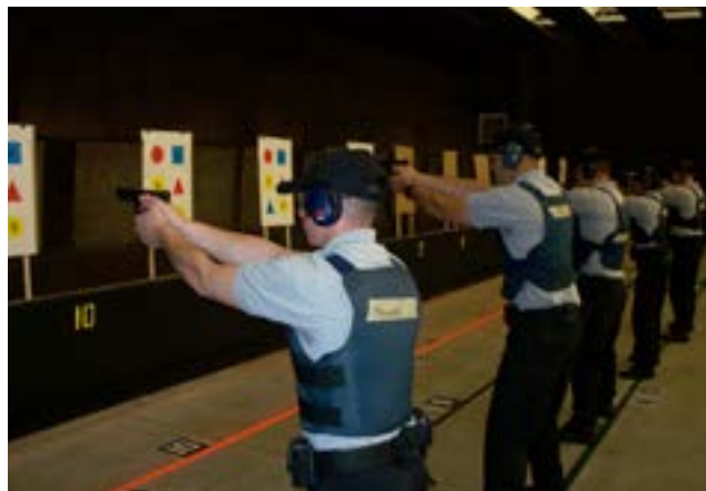
Military Police Basic Training Class - Firearms Training Grand Valley State University

Based on this formal assessment, the MCOLES is satisfied that the quality of the military candidates compares favorably on a number of measures with the recruits from the traditional academies.