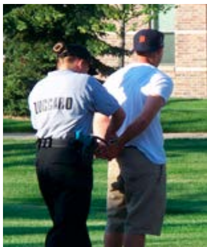
Military Police Basic Training Class Conducting Patrol Scenarios Grand Valley State University

Since its implementation, the program has attracted national attention and MCOLES has shared its program specifications and development processes with several other states through the International Association of Directors of Law Enforcement Standards and Training (IADLEST). The National Governor's Association (NGA) selected Michigan's MPBTP as a model program in their law enforcement transition category. The MPBTP will continue as long as there is a need and an interest from returning military police veterans. Additional information regarding the program can be found at the MCOLES website at www.michigan.gov/mcoles .