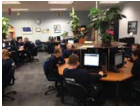
Recruits from Lake Superior State University taking the MCOLES licensing exam.

Although all recruits must pass this examination to become licensed, this is not the sole determinant of skills mastery. One test cannot fully evaluate recruit competencies. Accordingly, MCOLES requires that all academies administer periodic written examinations to their recruits, including a comprehensive legal examination near the completion of the school, in addition to individual skills assessments (firearms, emergency vehicle operations, subject control, first aid, and physical fitness). The recruits are assessed throughout their academy experience in a variety of manners in order to measure their suitability for the profession.