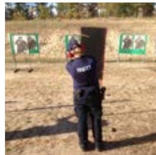
Recruit Target Practice at Northern Michigan College

West Shore Community College P.O. Box 227 Scottville, MI 49454