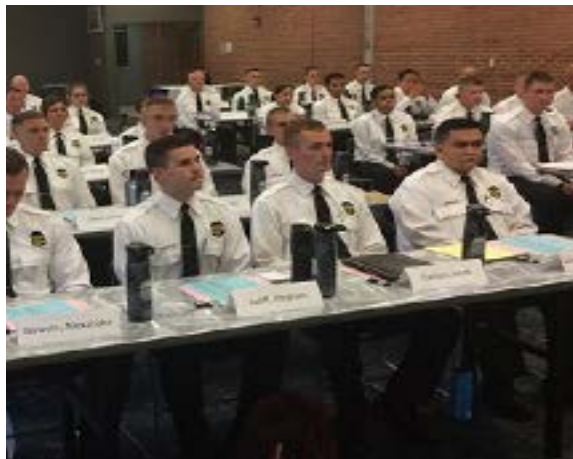
Grand Rapids Community College Police Academy Recruits

Over the years POSTs have been influential in promoting and improving training for the law enforcement profession. Organizations such as MCOLES have had a tremendous impact on the professionalism of policing through standardized training, valid entry requirements, and minimum competencies. The recommendations of previous Commissions have all called for improved professionalism. Ultimately it is the responsibility of MCOLES to address the safety of its citizens by ensuring all officers possess the minimum core competencies to perform their duties effectively.