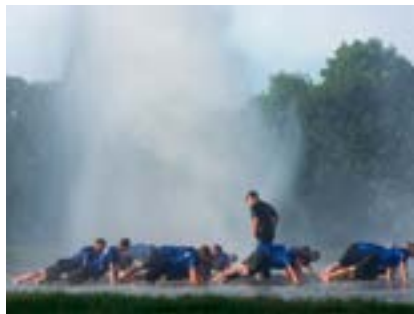
Grand Valley State University Recruits

The pre-service college basic training programs offer mandatory basic police training in conjunction with a college degree program. Students entering these programs are guided through a college-designed curriculum, which allows a qualified graduate to be eligible for licensure as a law enforcement officer upon achieving law enforcement employment. The academic content of these programs includes designated courses that incorporate the entire MCOLES mandatory 594-hour curriculum. Students must achieve satisfactory grades in each pre-service program course within a one-year time limit and be awarded an associate degree or higher. Presently, there are six locations that offer pre-service college programs.