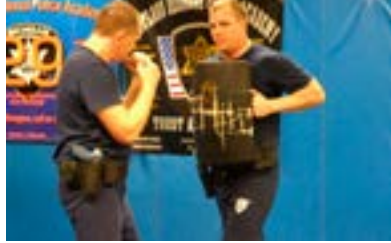
Recruits from Kirtland Community College

The pre-service college basic training programs offer mandatory basic police training in conjunction with a college degree program. Students entering these programs are guided through a college-designed curriculum, which allows a qualified graduate to be eligible for licensure as a law enforcement officer upon achieving law enforcement employment. The academic content of these programs includes designated courses that incorporate the entire MCOLES mandatory 594-hour curriculum. Students must achieve satisfactory grades in each pre-service program course within a one-year time limit and be awarded an associate degree or higher. Presently, there are six locations that offer pre-service college programs.