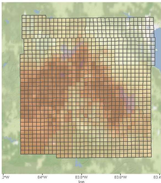
Figure 2. Example of spatially predicted bTB incidence in deer (all ages) in the core outbreak area estimated from a Force of Infection model. Darker the brown is greater probability of incidence. D. O'Brien, unpublished data.