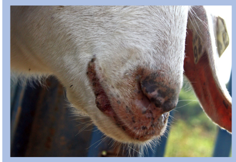
Sores on Mouth