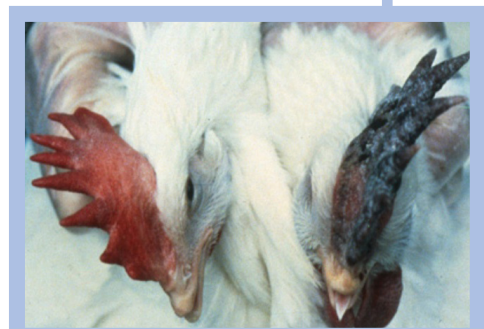
Swollen Head and Blue Comb (Right) (Left) Healthy Chicken

If experiencing multiple sudden deaths or neurological signs, call MDARD at 800-292-3939.