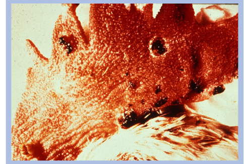
Dark or Crusty Spots on Comb