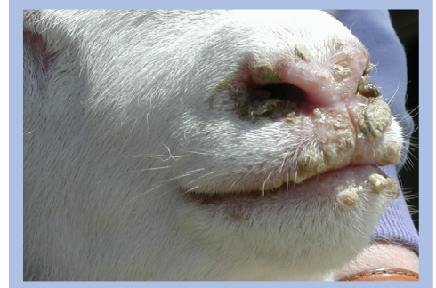
Sores on Mouth