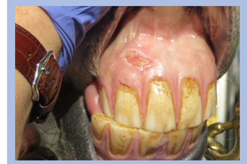
Sores on Gums