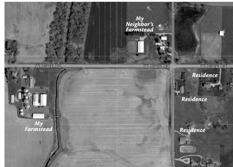
North ↑ Sample Neighborhood Map