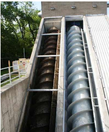
Screw Pump Lift Station