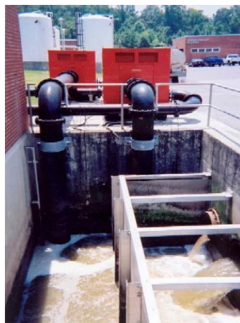
Self Priming Pump