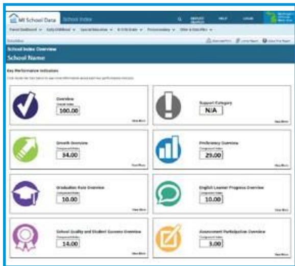
Figure 1: Michigan School Index System Components and Weights