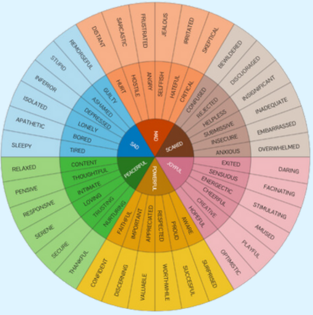
The Feeling Wheel

7. If you feel like you have eaten enough, and notice yourself eating food to cope, check in with your emotions. Take a five minute time-out. Ask: What am I feeling right now? Become aware of your range of feelings. **Refer to a feelings wheel, if needed. Ohoose a more general feeling or a specific feeling- whichever resonates with you most.