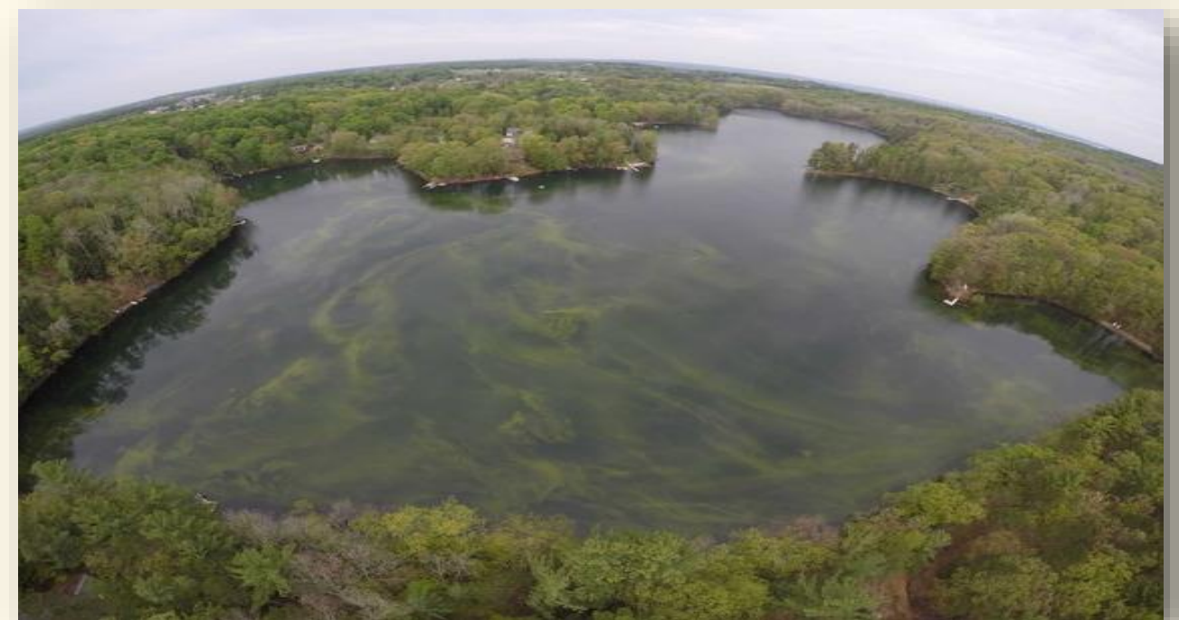
Aerial view of harmful algal bloom in Lake Michigan-- Department of Environment Great Lakes, and Energy

MDHHS BOL is the preferred laboratory for the analysis of the Statewide Public Water Supply Monitoring for Cyanotoxins Related to Harmful Algal Blooms Program, which is carried out by the Michigan Department of Environment, Great Lakes, and Energy (EGLE) Drinking Water and Environmental Health Division, Emerging Contaminants Unit. The data is generalizable to the State's surface water systems with results available quickly, within 7 days from the collection of the sample thereby, enabling immediate action to protect the population health. There are 52 sites across Michigan participating this program, with 12 of these sites enrolled in weekly analysis for Microcystins, Nodularin, Anatoxin and Cylindrospermopsin and 30 sites enrolled in biweekly analysis for Microcystins and Nodularin. On the average, BOL performs over 21,000 tests annually in support of the Statewide Public Water Supply Monitoring for Cyanotoxins Related to the Harmful Algal Blooms Program.