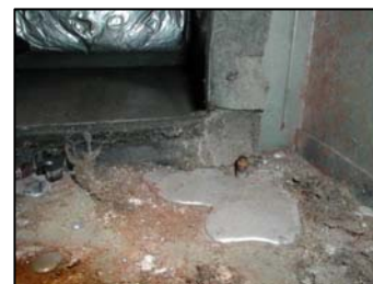
Mercury at the bottom of the return-air duct in a furnace

By that time, the mercury had been tracked all over the house and two of the children had mercury in their systems.