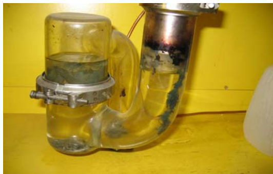
Traps, if poured down the drain