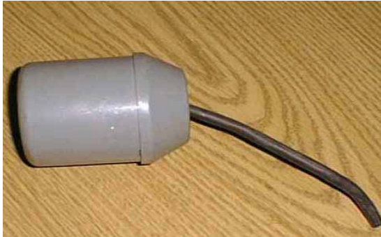
A sump pump float