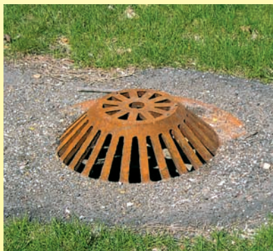
Storm sewer catch basin.