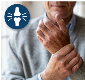
May help arthritis symptoms