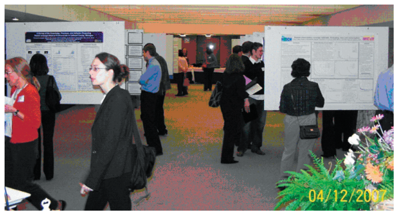
Conference attendees peruse the posters.

overweight, infectious disease, asthma, brain injuries, dental caries, and health disparities. There was also a session on careers in epidemiology, targeted towards public health students. There were a record 28 posters on display this year, also covering very diverse subject matter. Poster viewing was a lively part of the conference, as attendees networked and discussed findings.