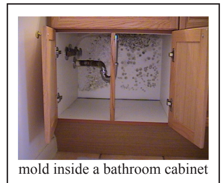
mold inside a bathroom cabinet