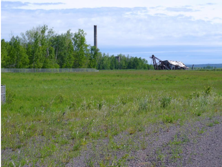
Figure 11. Debris at “Building in Mason,” west of former Quincy Reclamation Plant area (across M-26) in Mason (Houghton County), Michigan. (Picture taken September 6, 2007.)