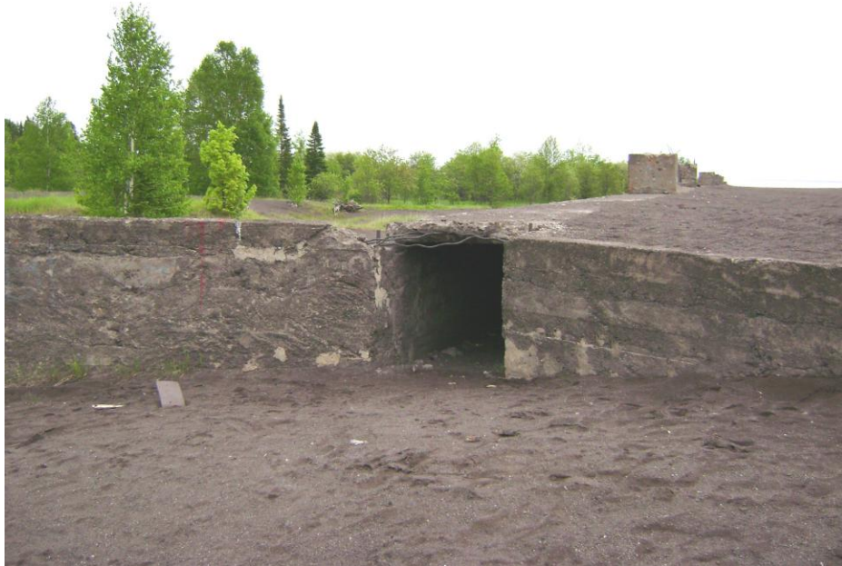
Figure 4. Ruins of Quincy reclamation plant in Mason (Houghton County), Michigan. (Picture taken June 16, 2008.)