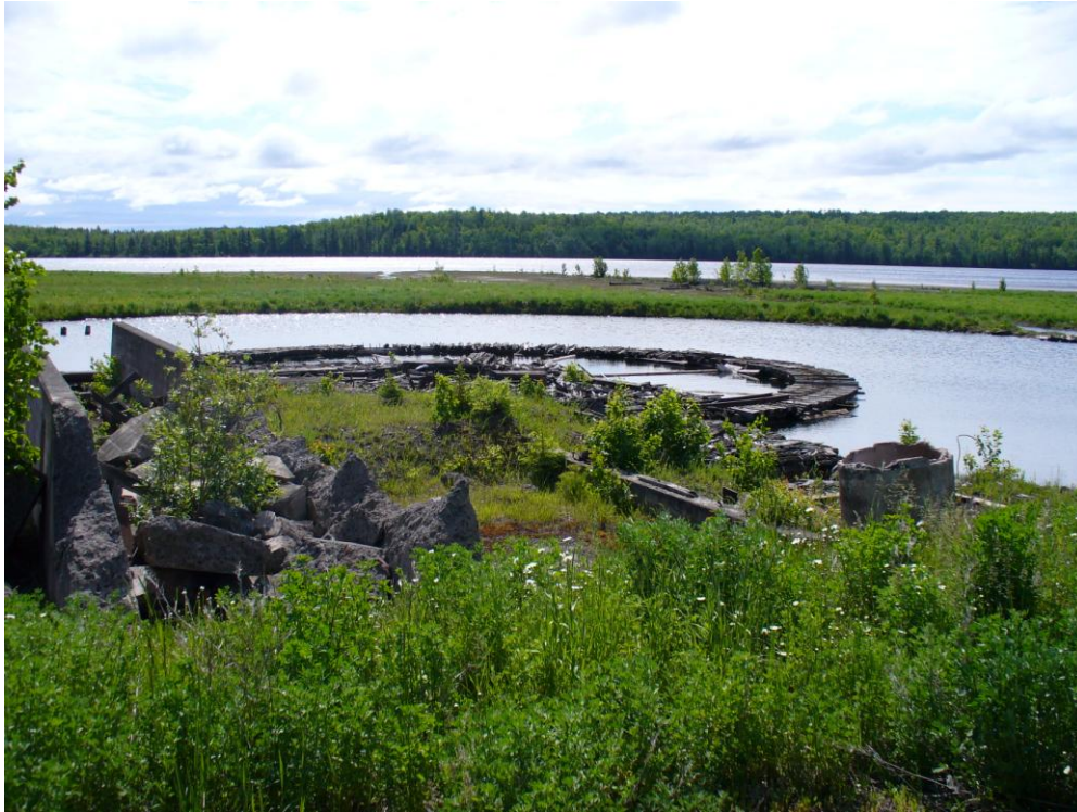
Figure 8. Partially sunken dredge in Torch Lake near former Quincy reclamation plant in Mason (Houghton County), Michigan. (Picture taken June 16, 2008.)