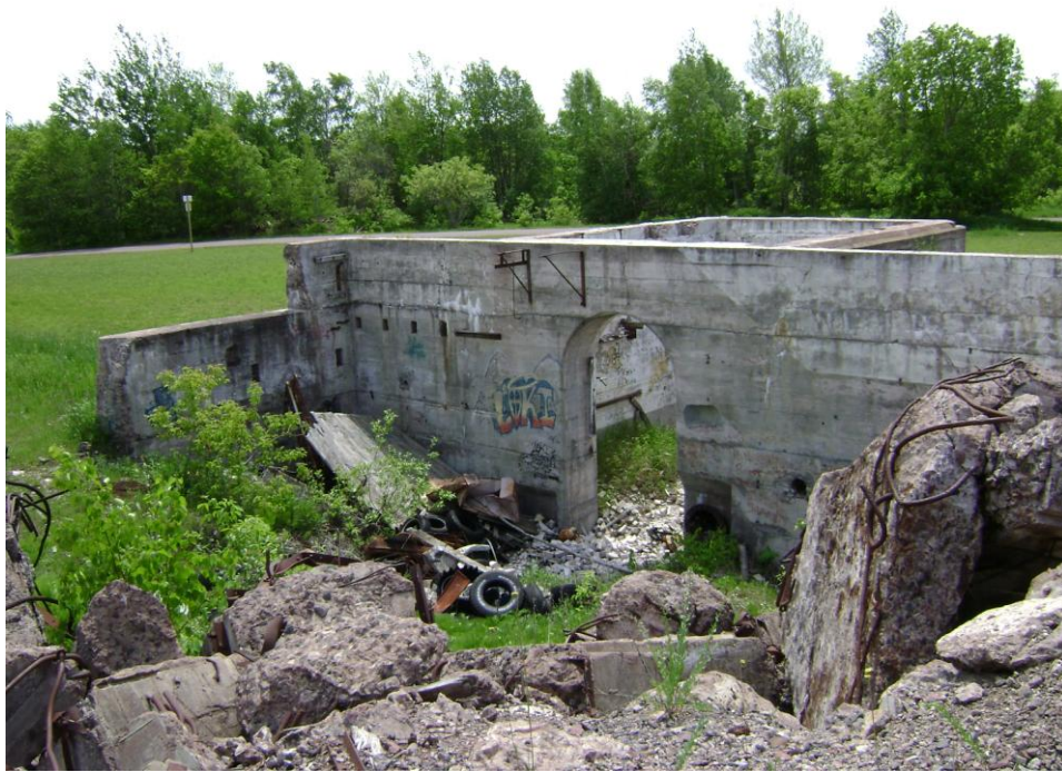
Figure 19. Overview of public beach and former slag dump in Hubbell (Houghton County), Michigan. (Symbols indicate environmental sampling locations, not discussed here.)