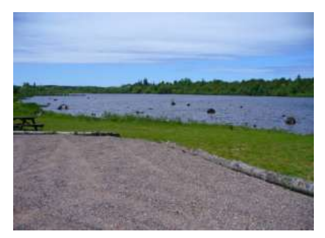
Figure 9: Calumet Lake and parking area, picture taken July 2008.

Table 6: Maximum levels (in parts per million [ppm]) of inorganic chemicals in Boston Pond and Calumet Lake sediment collected in 2008 (MDEQ 2009B).