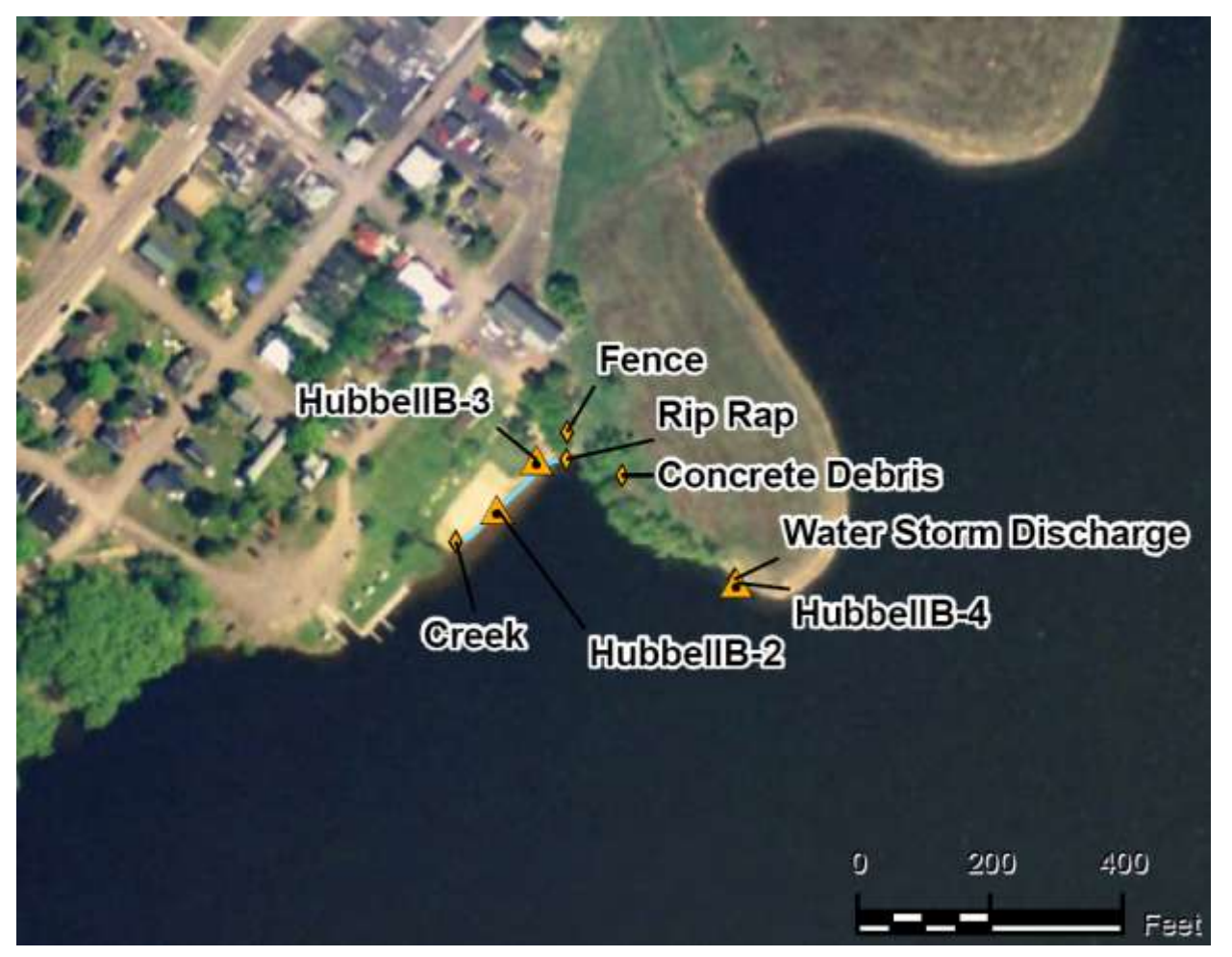
Figure D-2: Map of the Hubbell Beach and slag dump area (Weston 2007A). HubbellB-2, -3, and -4 are sample locations.