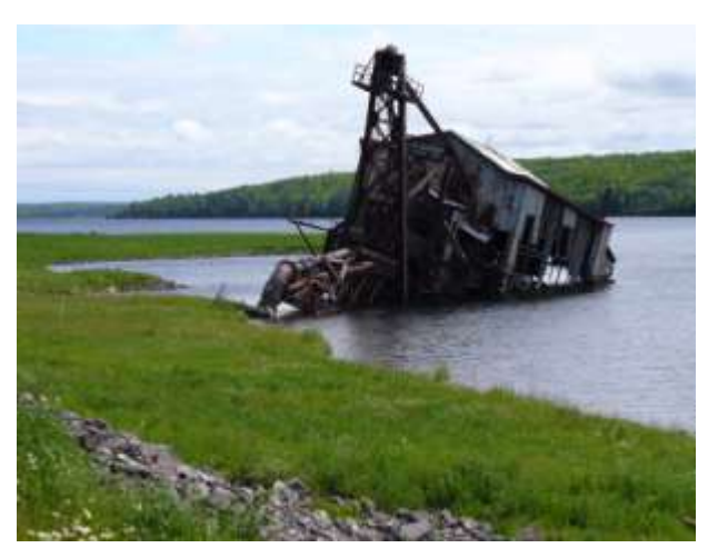
Figure 6: Partially sunken Calumet and Hecla/Quincy Reclaiming Sand Dredge at Mason, picture taken July 2008 (MDCH).

The Mason stampsands area includes structures from historical mining activities. In Torch Lake, just offshore is a sand dredge (Calumet and Hecla/Quincy Reclaiming Sand Dredge). See Figure 6. It is a state registered historical site (state registered historical site number P23275). Visitors and residents are allowed access to this location, and graffiti is on many visible areas and interior walls of the dredge (S. Baker, MDEQ, personal communication, 2012). Ruins of a building are present near the shore and are used for recreational activities, such as paintball (Figure 7). For further information on physical hazards present at this location and the Torch Lake Superfund site, please review the "Physical Hazards in the Torch Lake Superfund Site and Surrounding Area" public health assessment (ATSDR 2012).