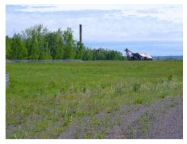
Figure 4: Expanse of partial vegetative cover toward the dredge at Mason, picture taken July 2008.

samples were sent to a laboratory for analysis. All seven of the samples were analyzed for PCBs. No PCBs were detected. Table 5 presents the maximum levels of inorganic chemicals without or over the site-specific screening levels or comparison values. (See Table C-5 in Appendix C for the full list of chemicals measured during this sampling.) Figure 4 and 5 are of the expanse of the stampsand at Mason. Locations included in this area were the Mason Area Ruins, Mason Sands, and Tamarack Sands.