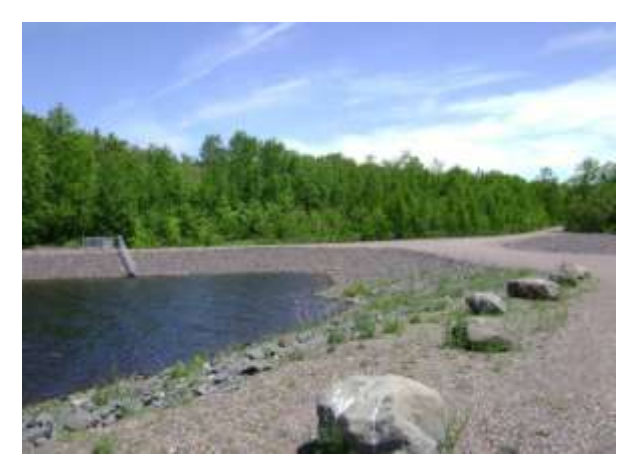
Figure 8: Boston Pond and driveway entry, picture taken July 2008.

Figure 8 shows a portion of Boston Pond and the access from the road, while Figure 9 shows the parking area for Calumet Lake. Table 6 presents the maximum levels of inorganic chemicals from both Boston Pond and Calumet Lake sampling over the site-specific screening levels or comparison values. (See Table C-6 in Appendix C for the full list of chemicals measured.)