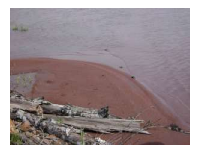
Figure 3: Stampsand along the shore of Torch Lake near the Lake Linden Village Park beach, picture taken July 2008 (MDCH)