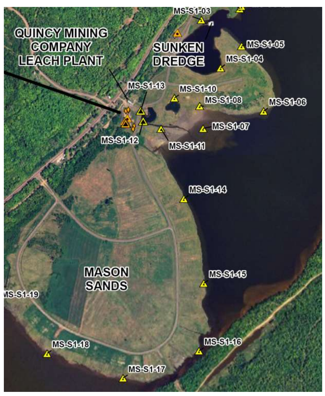
Figure D-3: Map of the Mason stampsands area (Weston 2007A). Triangles with MS-S1-XX are sample locations.