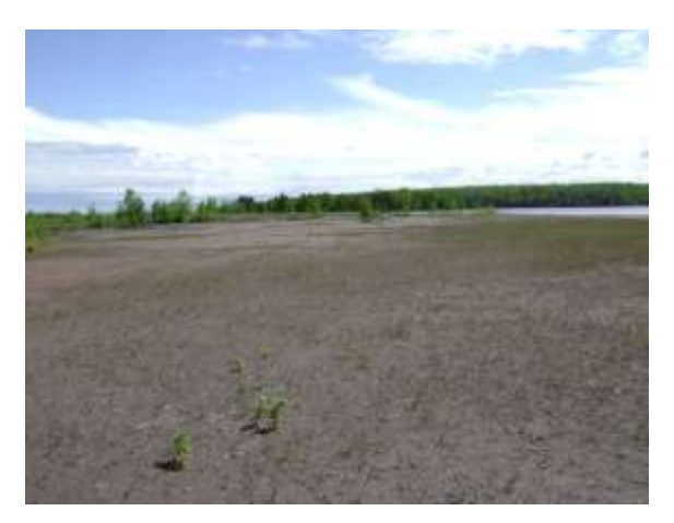
Figure 5: Expanse of exposed stampsand at Mason, picture taken 2008 (MDCH).

Table 5: Maximum inorganic chemical levels (in parts per million [ppm]), from laboratory and x-ray fluorescence (XRF) analysis, in soil samples from the Mason Stampsands in 2007 (Weston 2007A).