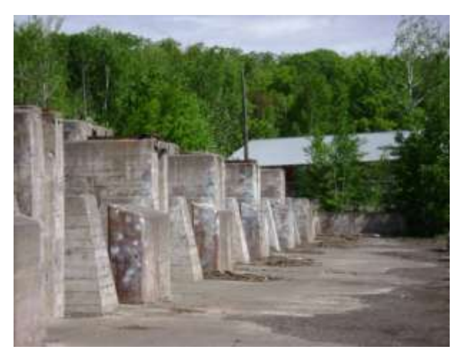
Figure 7: Ruins at Mason with paintball marks, picture taken July 2008 (MDCH).