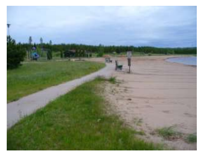
Figure 2: Beach area at the Lake Linden Village Park, picture taken July 2008.

c = The comparison value is the ATSDR chronic environmental media evaluation guide for a child.