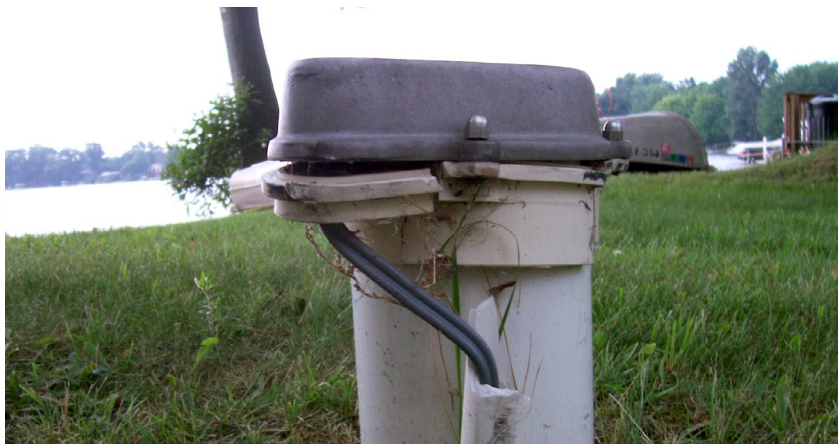
Damaged wellhead with cracked well cap and exposed wires