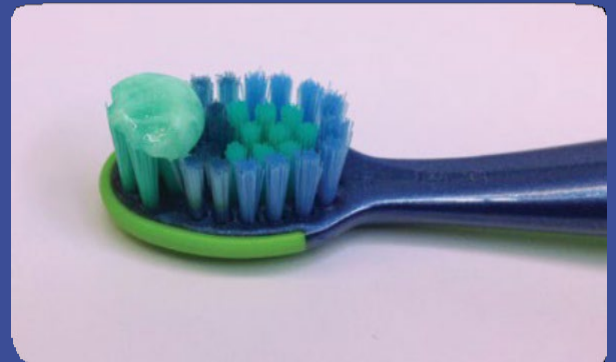
"Pea-size" of fluoride toothpaste