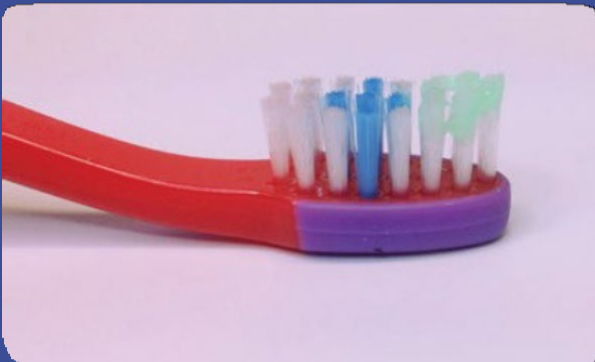
"Smear" of fluoride toothpaste