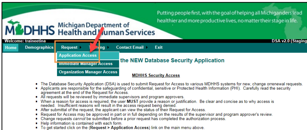
Figure 2: DSA Home