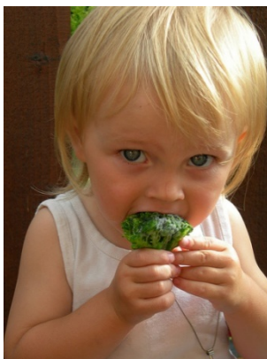
Veggies!