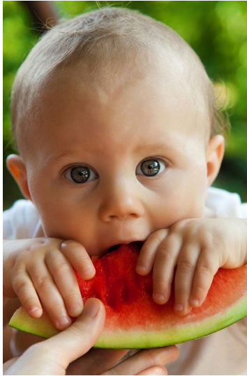
Baby Bite.