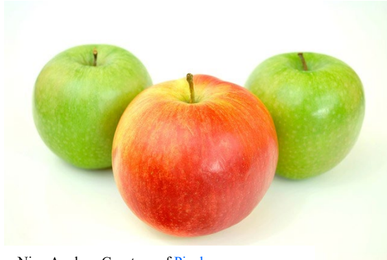
Nice Apples.