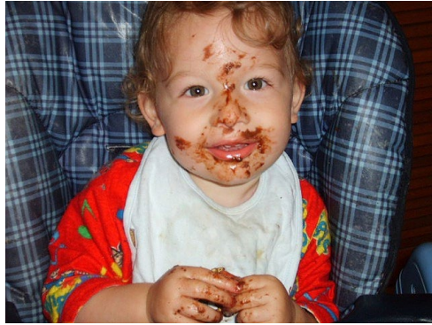
Messy Eater.