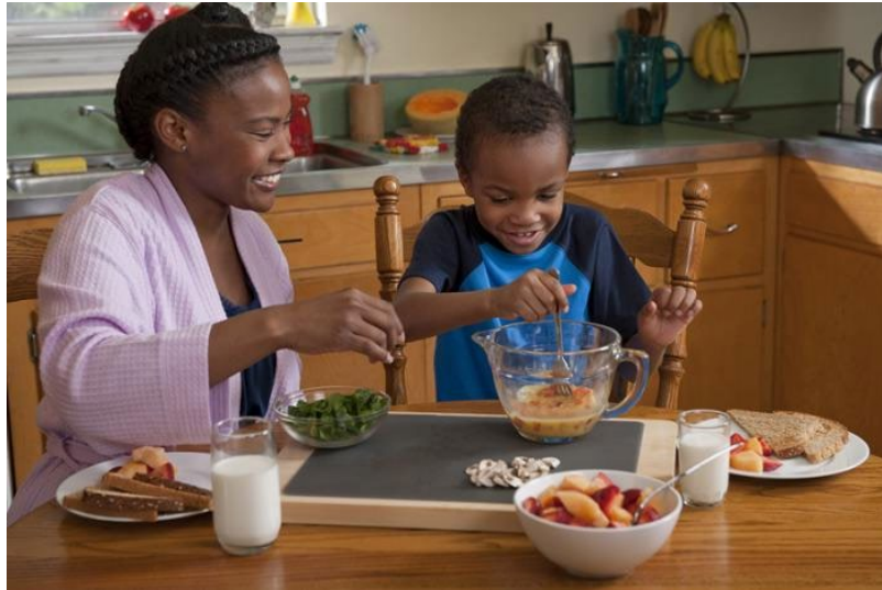
“A woman and her son prepare an omelet.”