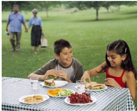
“A boy and a girl talk during a picnic while grandparents walk in the background.”

Please keep in mind that providing consistent meals and snacks can help your child develop healthy eating habits.