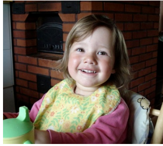
Happy Eater.