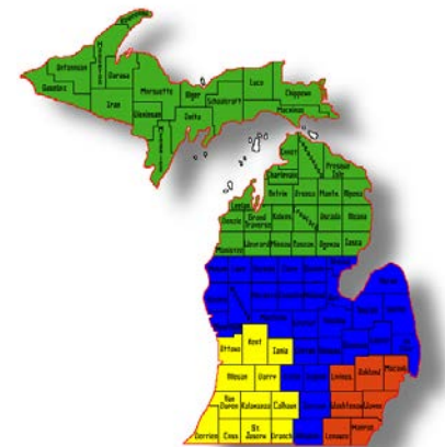
CRE Regions in Michigan

The number of facilities, number of CRE cases, total patient days, and overall CRE incidence rates per 10,000 patient-days, stratified by region (only acute care facilities) or long-term acute care (LTAC) or long-term care (LTC) facilities are shown below.