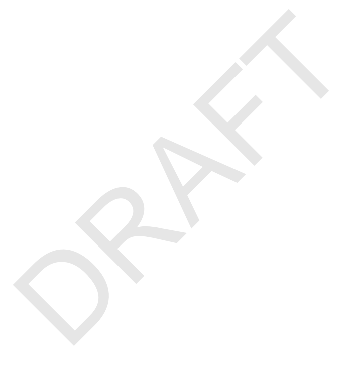
Table of Contents Definitions/Explanation of Terms