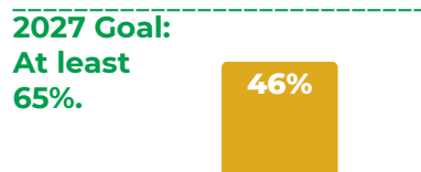
Percentage of Eligible People Age 20-35 Who Received a PrEP Referral, 2022

While similar to the statewide average, fewer than half of eligible people age 20 to 35 received a pre-exposure prophylaxis (PrEP) referral.