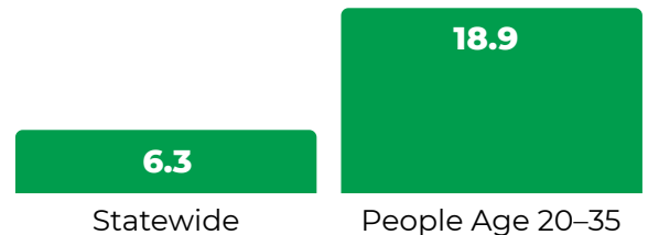
Rate of New HIV Diagnosis per 100,000 People, 2021-2023

People age 20 to 35 had a new HIV diagnosis rate of three times the state average from 2021 - 2023. This disproportionate impact is driven by structural failings in our health systems that make it difficult for this age group to access and navigate care.