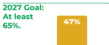
Percentage of Eligible Black/African Americans Who Received a PrEP Referral, 2022

While similar to the statewide average, fewer than half of eligible Black/African Americans received a pre-exposure prophylaxis (PrEP) referral.