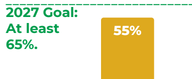
Percentage of Eligible MSM Who Received a PrEP Referral, 2022

While higher than the statewide average, almost half of eligible MSM are still not receiving a pre-exposure prophylaxis (PrEP) referral.