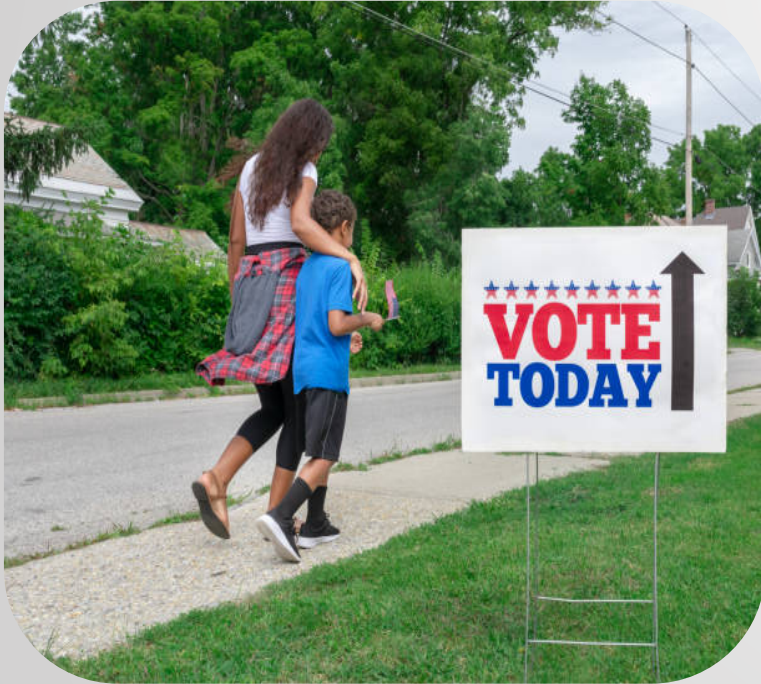
Goal 1: Increase Civic Engagement