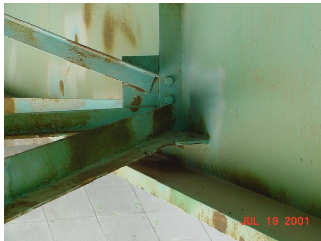
Figure 7.09.07 Type 1 Gusset