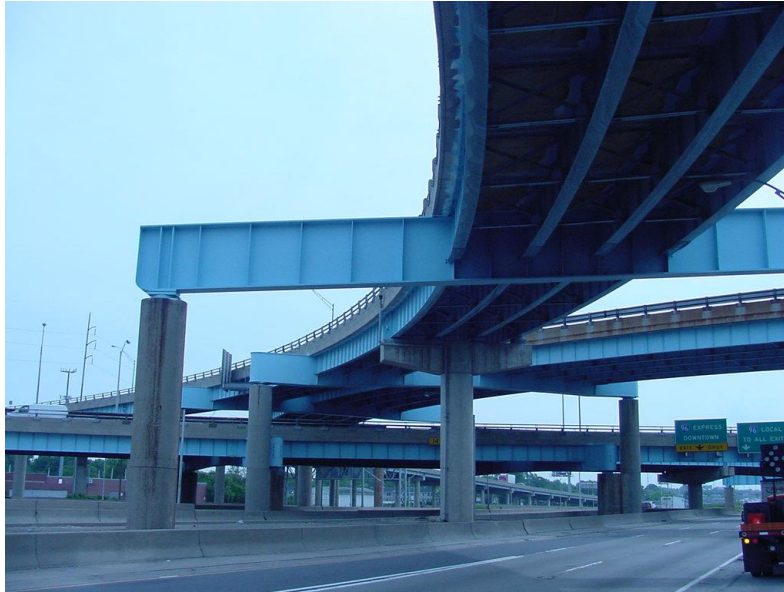
Figure 7.06.01 Steel Cross Girder