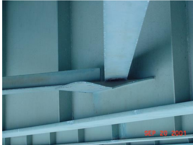
Figure 7.09.08 Type 2A Gusset

The Miscellaneous Field Notes section allows the team leader performing the fracture critical inspection to note observations concerning non-fracture critical members (see Figure 7.09.09). The inspector must also note traffic control, special equipment, or if photographs were taken. Most FCM inspections will require traffic control and equipment such as a bucket truck or under-bridge inspection unit for an arms-length inspection. The comments field allows the inspector to provide additional details. The photographs radio button should only be selected no for an extenuating circumstance that must be noted in the section.