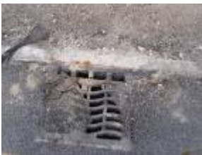
Waste Material Entering a Storm Drain Due to Lack of Pollution Prevention Activities