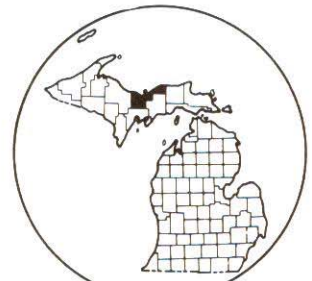
KEY TO COUNTIES