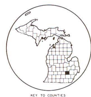
KEY TO COUNTIES