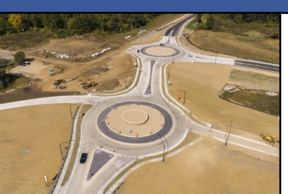
Elm Road - North of I-94