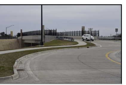
Looking South at S09 Elm Rd