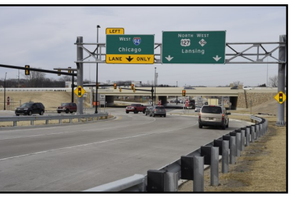
NB West Avenue