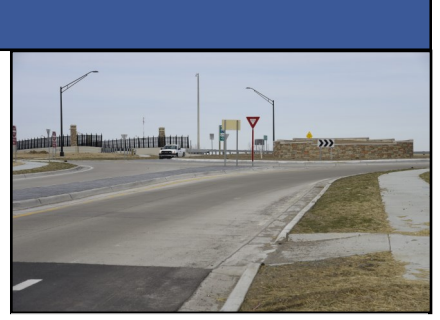
NB Elm Road