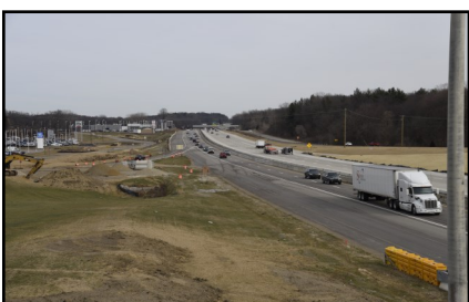
NE Quad I-94 & Elm Road