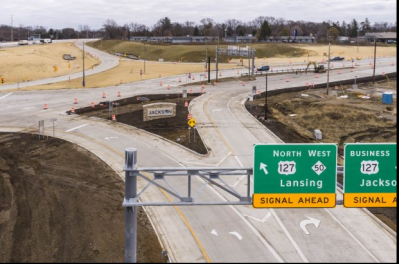
WB I-94 Exit to US-127