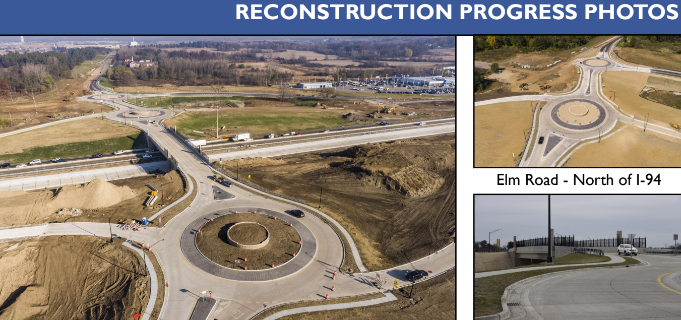
Elm Road Interchange - Looking North