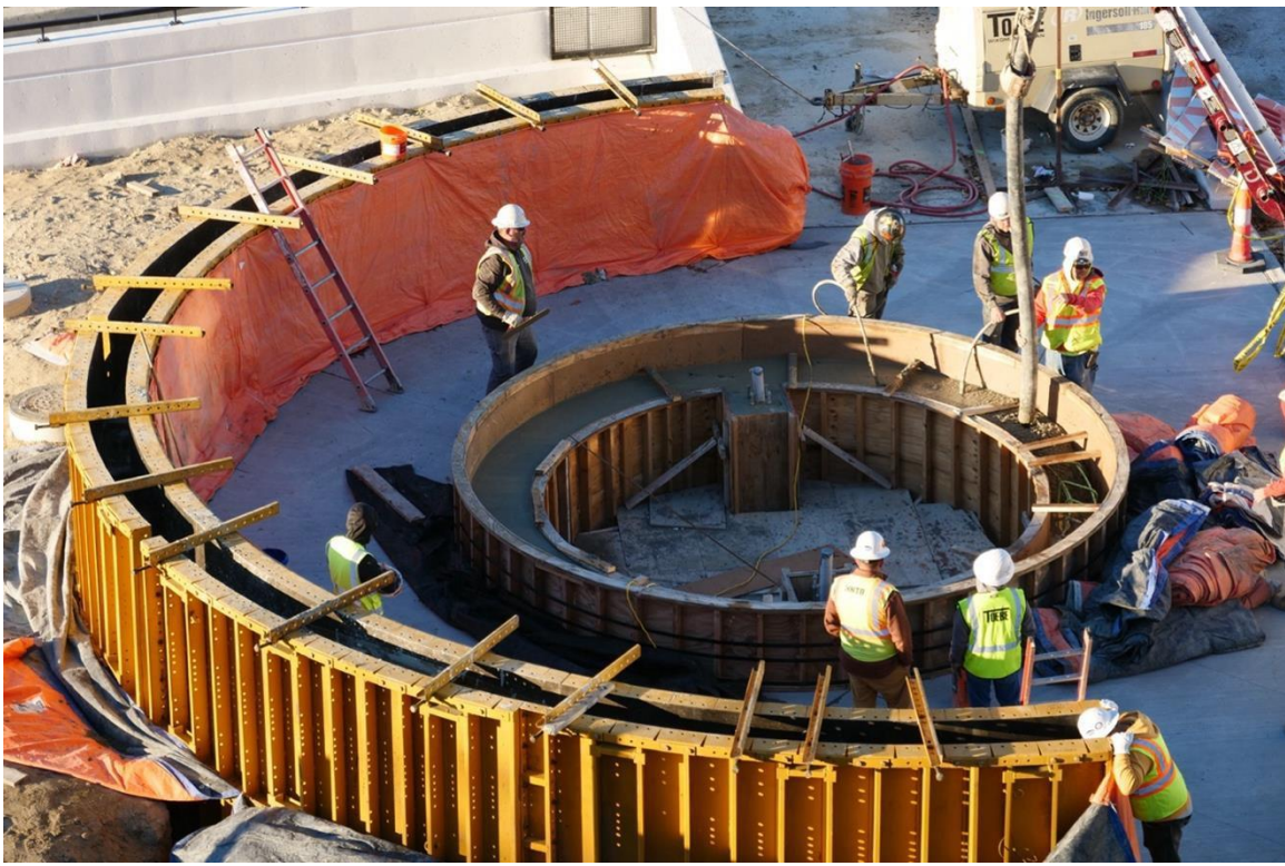
Contractors form the circular bench wall.