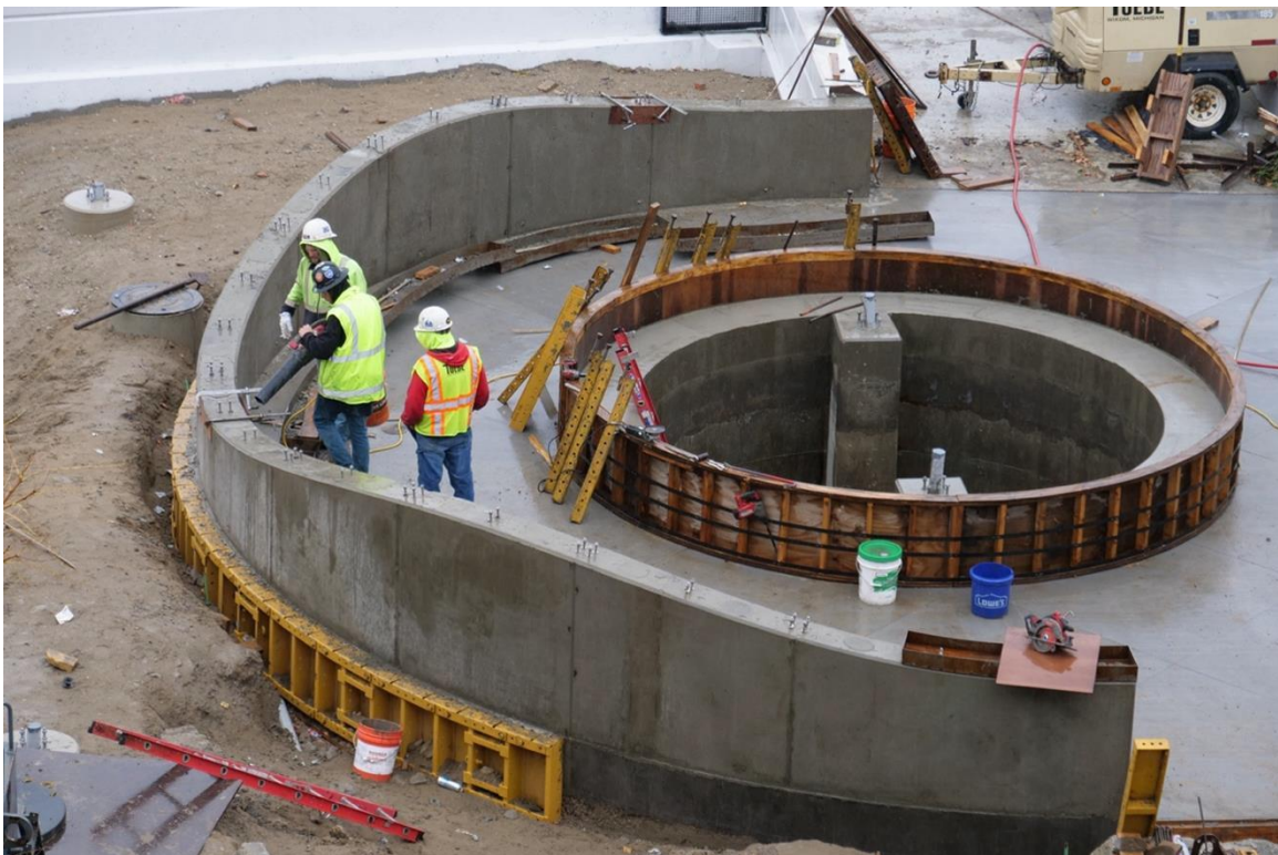
Contractors prepare for the installation of the stainless-steel screen.