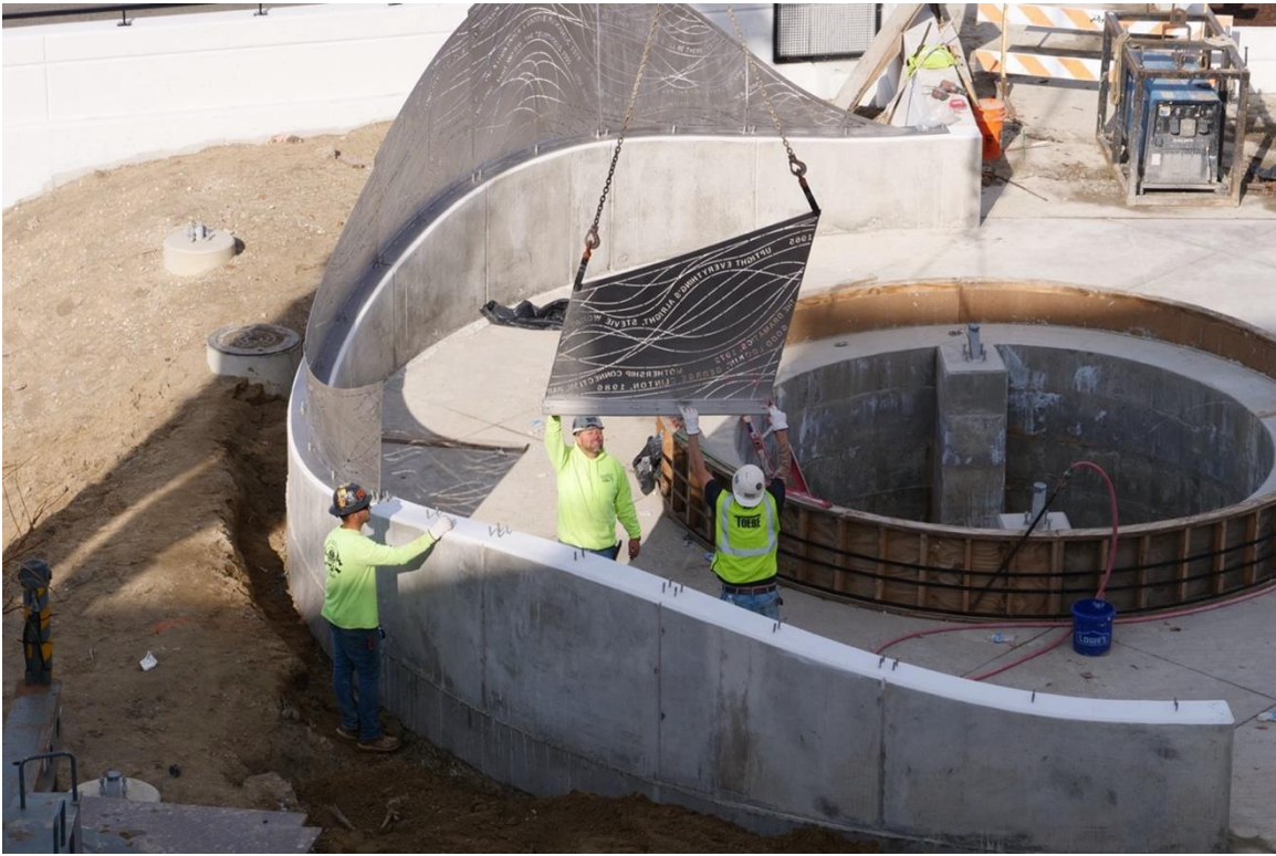
Contractors install the stainless-steel screen.