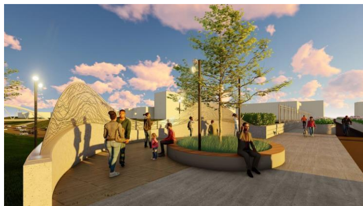
The artist’s renderings of Sounds of Detroit.