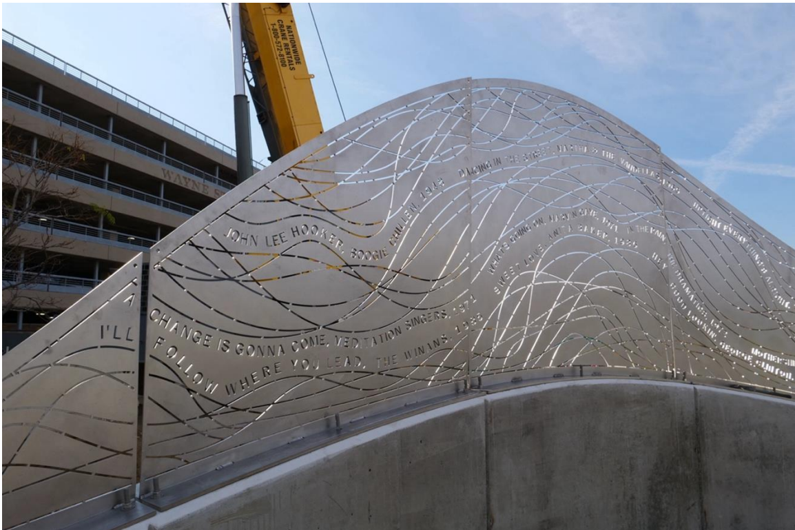
“The lines of text move and roll with the lines of the soundwaves, much the way lyrics respond to the rhythm and timing of a song.”