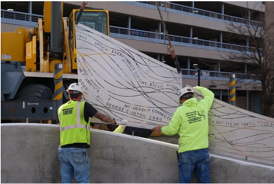
The curve of the stainless-steel screen dips in the middle of the wall and frames the Second Avenue bridge.