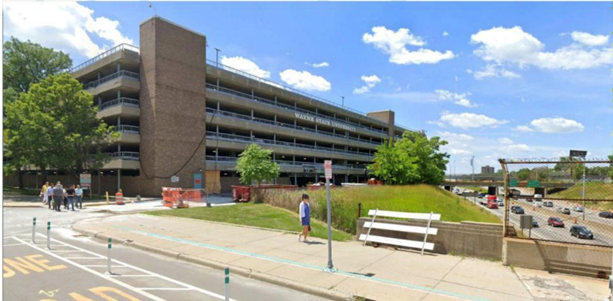
The southwest corner of the Cass Avenue bridge before construction.