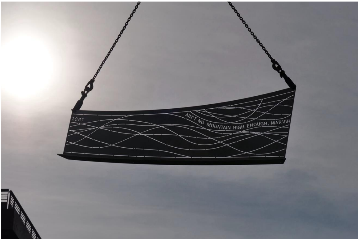
The songs and artists have been laser-cut into the stainless-steel screen.