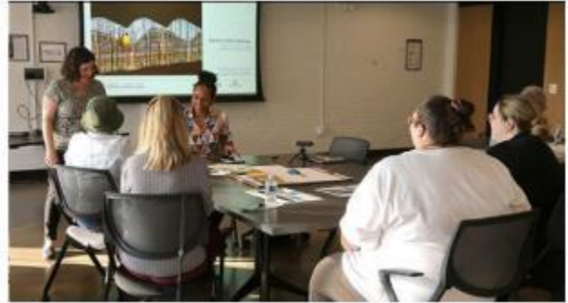
At the first community forum, attendees were inspired by Detroit's music.