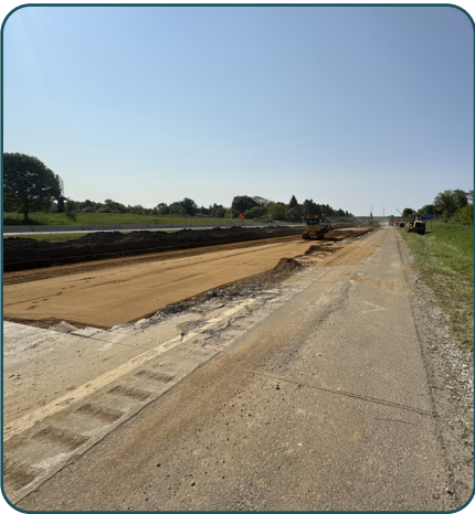
Image 2. The contractor is making progress with rebuilding southbound I-69.

For more information, visit the project page: