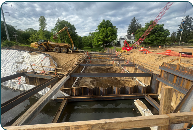
Image 1. Work continues on the Bear Creek culvert replacement with cofferdam installation, water diversion and earth excavation.