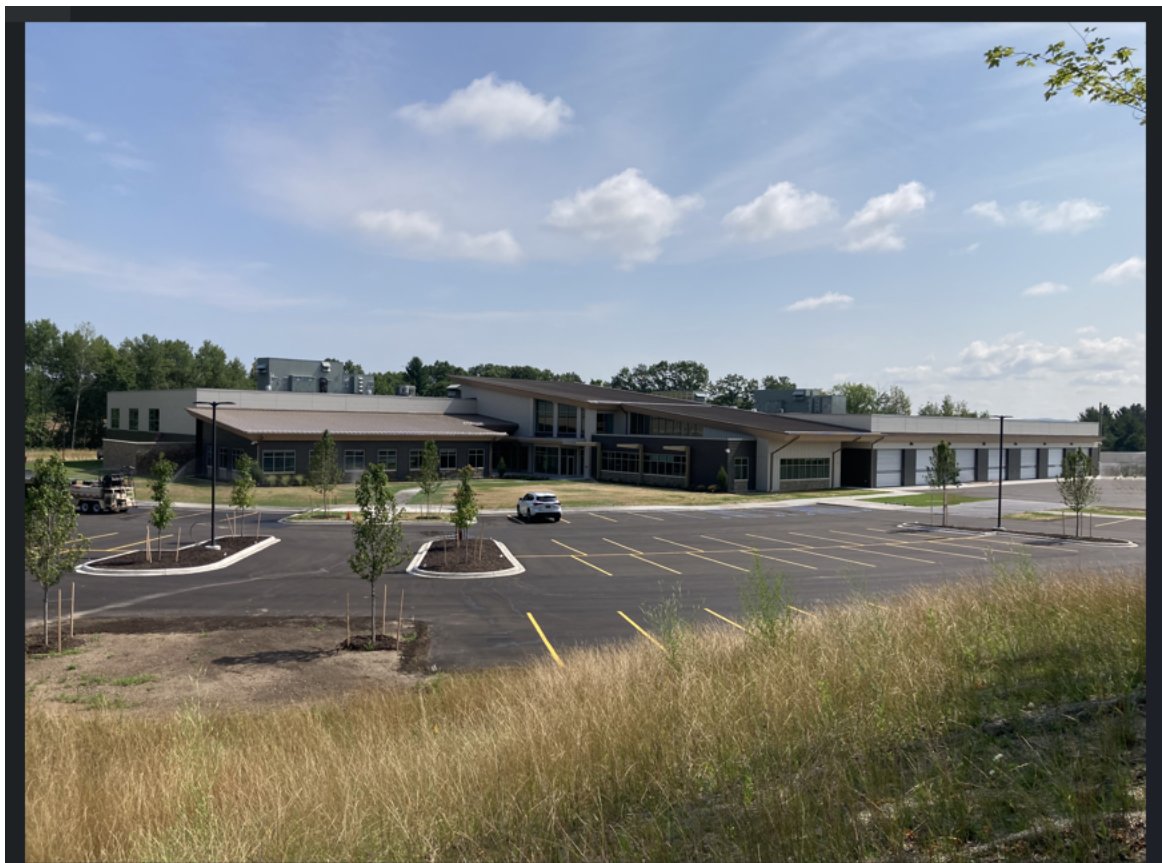
BATA new HQ progress: BATA's newly constructed facility, with new parking lot lines painted.