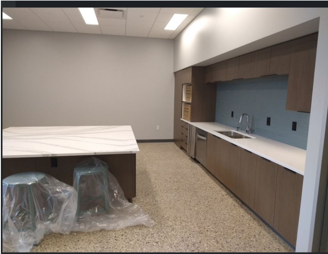
BATA new HQ kitchen: Well laid out kitchen to help staff with meals.