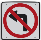
No Left Turn

At some locations, Highway B is prohibited from traveling through the intersection, which can be signalized or unsignalized. In those cases, Highway B must turn right onto Highway A, move to the far-left lane and turn left into the median crossover. When traffic clears, the driver will make a left turn onto Highway A and then move over to the right lane and turn right in order to continue on Highway B. (See Scenario 2)