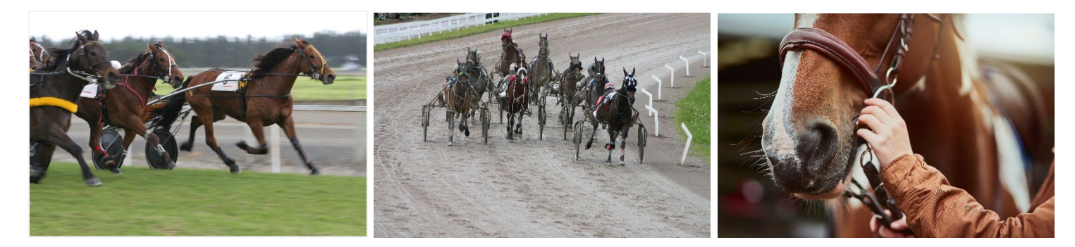
Horse Racing Annual Report 2021