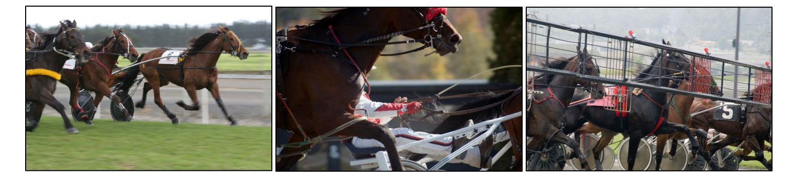
Horse Racing Annual Report 2022