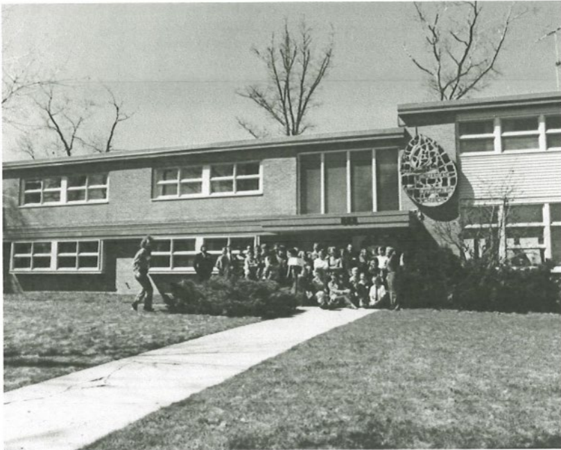
Grove St Building