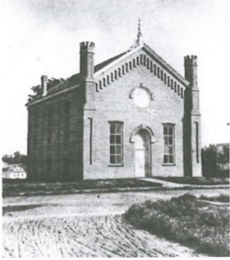
First church building 1859