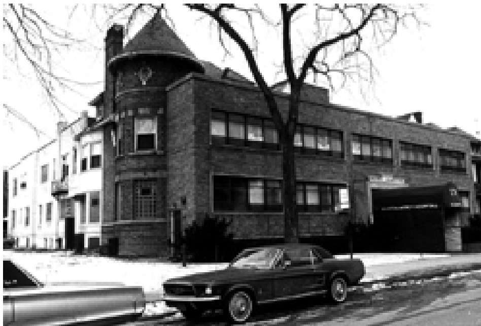
The former Burton Mercy Hospital