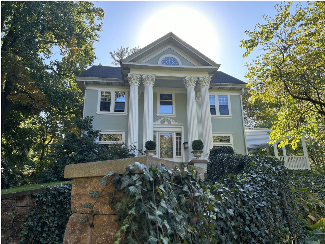
The house today.