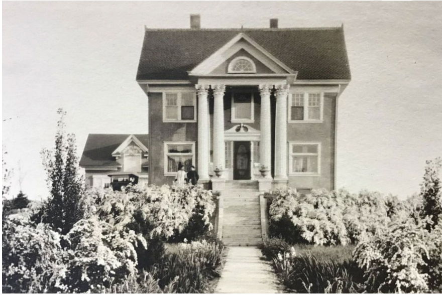
The house in 1915.