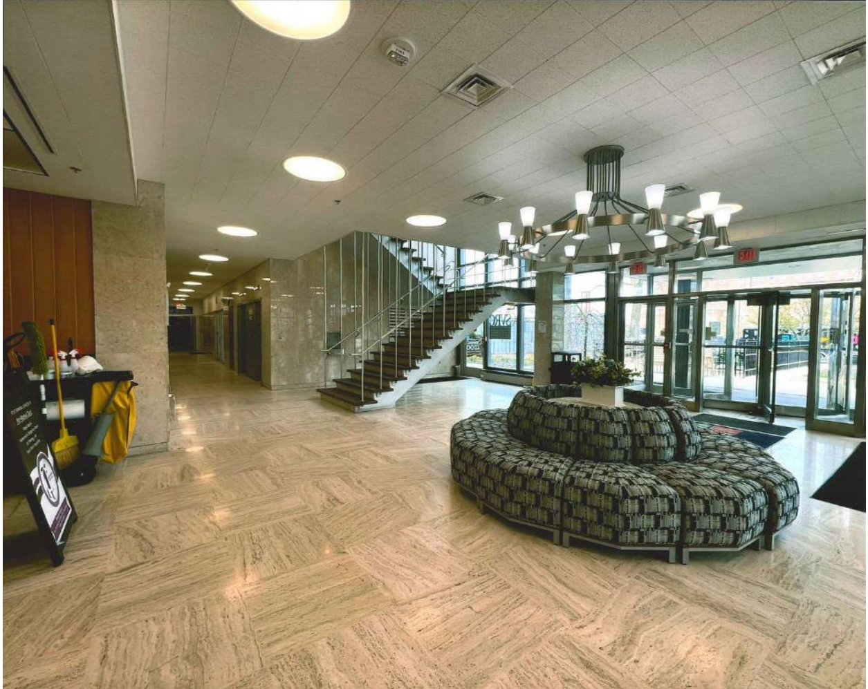
Figure 3. Current state of the main lobby