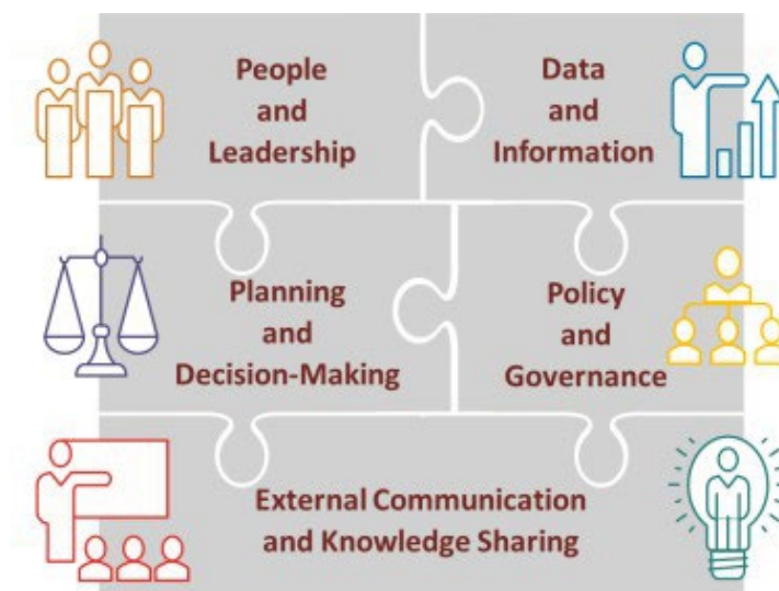
Figure 1: AM Champions: Curriculum Focus Areas

In response to growing demand, the MIC has expanded the AM Champions program to include two cohorts per year starting from fiscal year 2023. This expansion will ensure that professionals statewide have timely access to this crucial training. So far, the program has graduated over 500 participants statewide, with Asset Management Champions located in over 70 counties in Michigan.