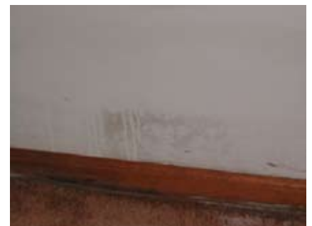
mold on a wall and carpet