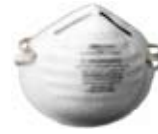
N-95 mask (you can buy at a local home improvement store)