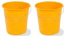
two buckets (1 gallon size or larger)