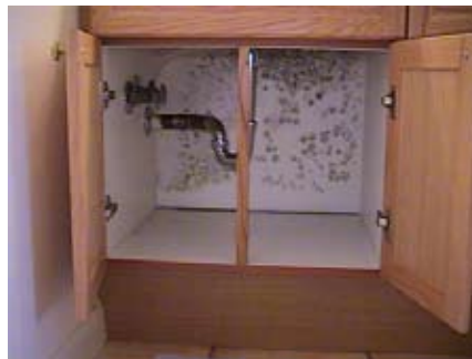
mold inside a cabinet