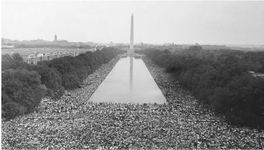
An aerial shot of a scene from the 1963 March on Washington.