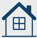
Lead Safe Home Program

Since 2019, MDHHS and BCHD have collaboratively worked together to provide lead services to the City of Benton Harbor residents. To learn more call MDHHS at 866-691-5323.