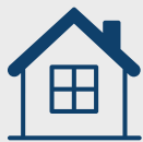
Lead Safe Home Program

Since 2019, MDHHS and BCHD have collaboratively worked together to provide lead services to the City of Benton Harbor residents. To learn more call MDHHS at 866-691-5323.