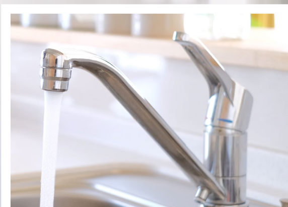
Old faucets and fittings that were sold before 2014.