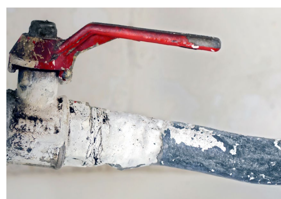
A lead service line carrying water from the street to the home.