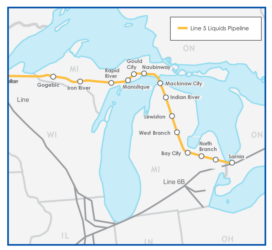
Figure 2: Line 5 proposed liquid pipeline

the ALJ and the Commission. In December 2020, the Commission issued an order requesting that the parties and the ALJ evaluate how and whether Governor Gretchen Whitmer's and the State of Michigan's November 13, 2020 notice of revocation of the 1953 easement for the dual pipelines in the Straits might change the scope of this case. In May 2021, the ALJ set a revised schedule for the case to permit the parties to file new evidence, which pushed back the timeline for a Commission decision. The Commission also issued an order in July 2022 reopening the record to receive further testimony, exhibits, and rebuttal, stating that it was necessary for the Commission's Act 16 review to address safety and engineering issues raised by the participants to the case. The schedule was further revised to accommodate the filing of testimony and rebuttal, to permit cross examination, and to accept briefings from the parties, which was necessary to facilitate a decision by the Commission.