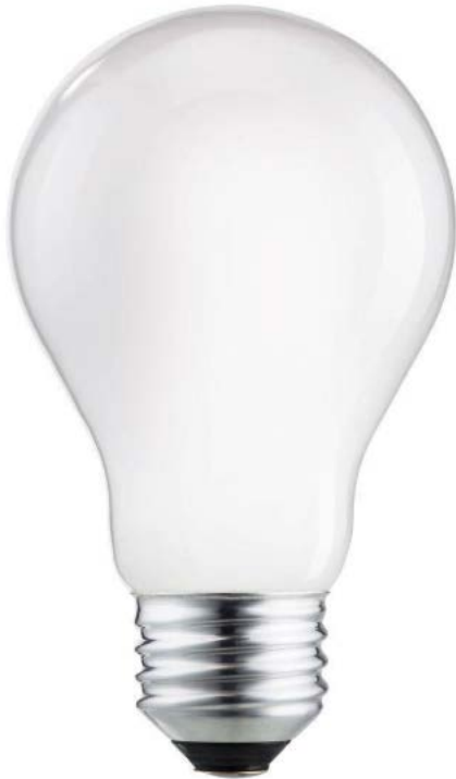
Philips “75-Watt Equivalent” A19 Halogen Long-Life Bulb” Life: 2.3 years (at 2.3 hrs/day)