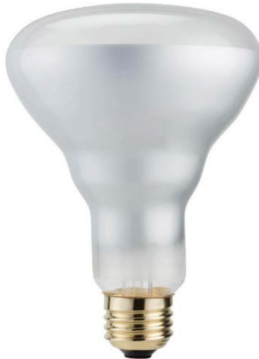
Philips “65-Watt Equivalent BR30 Halogen Dimmable Flood” Life: 2.6 Years (at 2.3 hours/day)