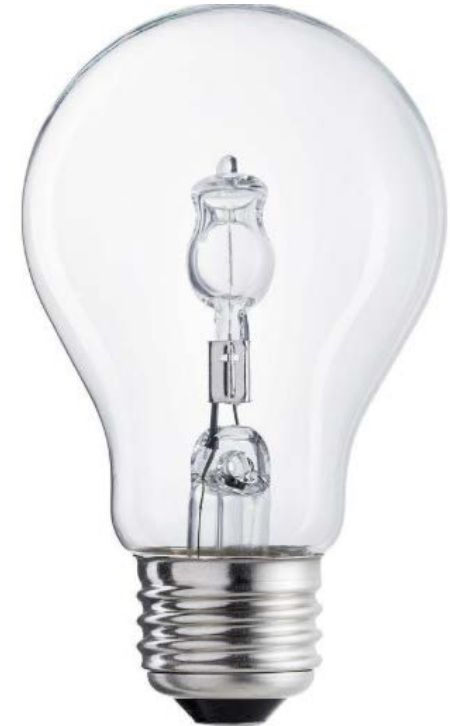
EcoSmart “60-Watt Equivalent A19 Halogen Soft White Bulb” Life: 1.2 Years (at 3 hours/day)

2018 Michigan MEMD estimates LED savings assuming 840 hours/year, or 2.3 hours/day.