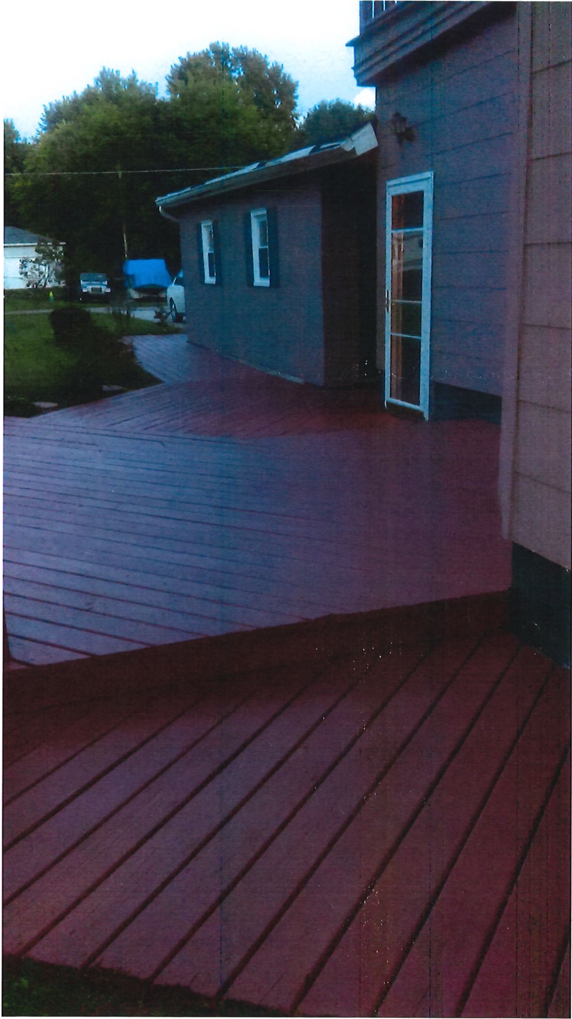
546 Bourn St. Vassar