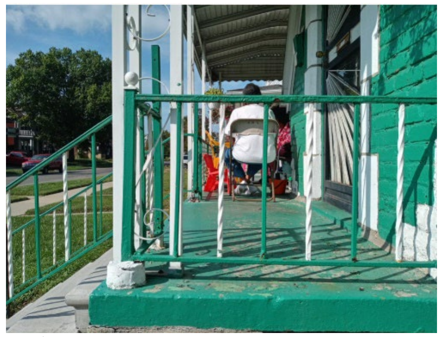
Clements, Before and After (porch rails and handrail)