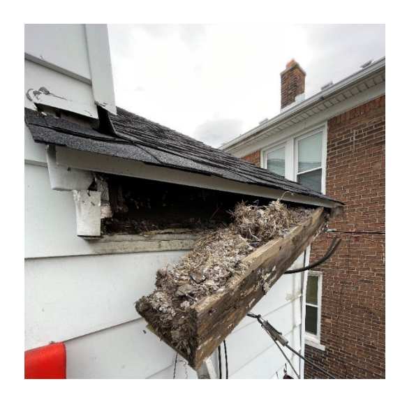
Ford 1, Before and After (Gutters, Downspouts, Fascia)