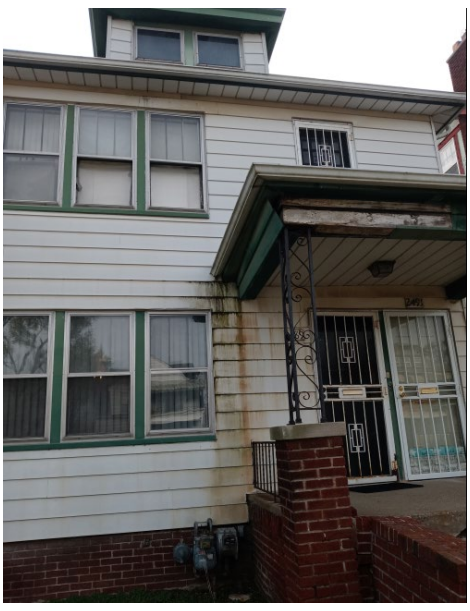
Ford 2, Before and After (Gutters, Soffits, Rails)